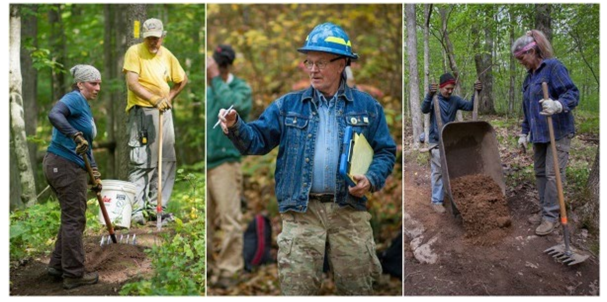
Mobile Skills Crew 2023 Events

Have you thought about getting involved with MSC (Mobile Skills Crew) projects? The MSC calendar has been set and there are projects going on all over the state in 2023. Attending an event is a great way to learn about trail building, invasive species removal, and building structures such as boardwalk and bridges. Experience is not a requirement. It's terrific on-the-job training. Information on the events is available on the Ice Age Trail Website. Check it out at: <a href="https://www.iceagetrail.org/our-work/trail-building-maintenance/msc-program/">https://www.iceagetrail.org/our-work/trail-building-maintenance/msc-program/</a> Note: While the full calendar is posted, not all the details have been included yet. The page should be completed in the next couple of weeks.