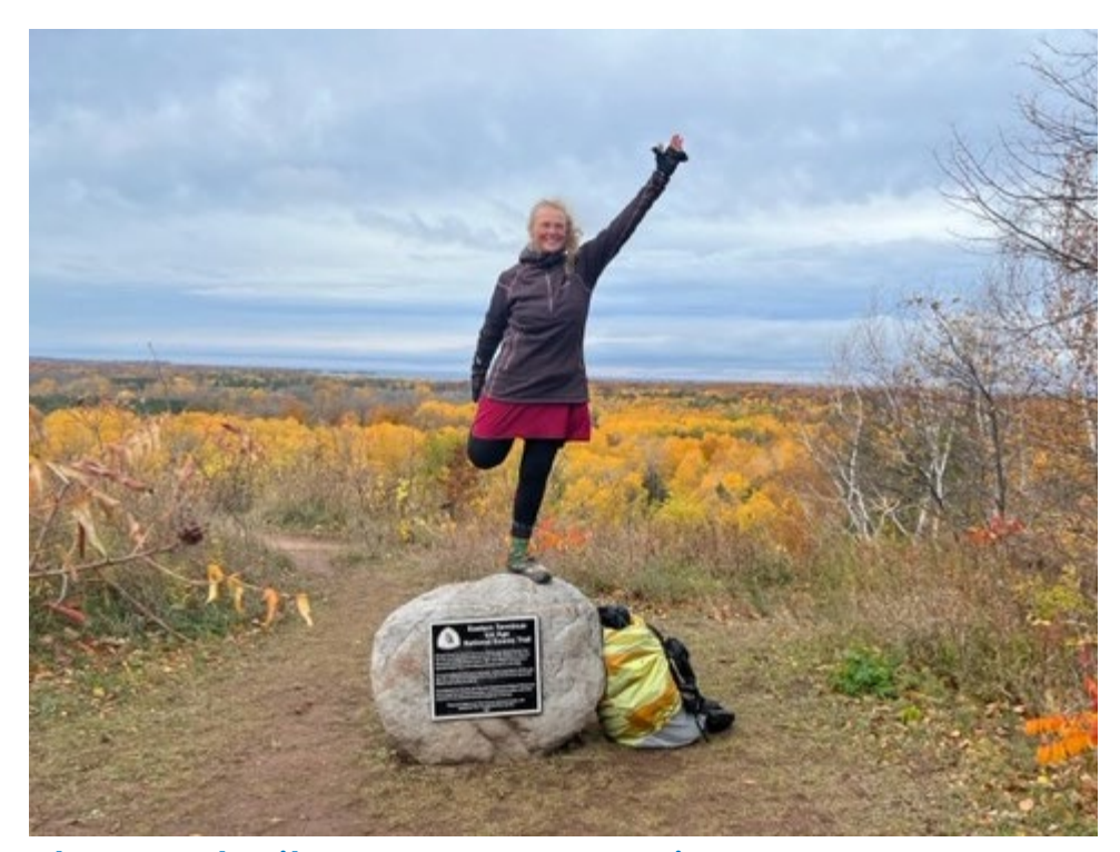
Thousand Miler Happy Hour Series - ZOOM - FEB. 7TH SESSION

The Ice Age Trail Alliance is offering this series of Zoom meetings which are part of their Virtual IAT-University program.