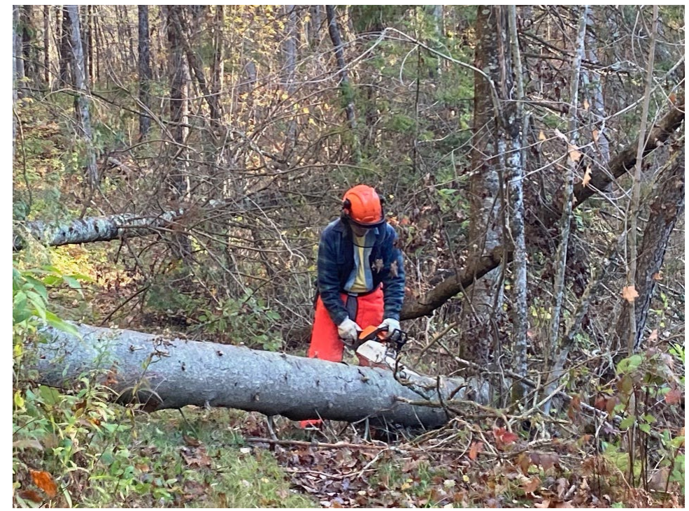
Time to Renew Your Volunteer Agreement

The Blue Hills will also have monthly trail maintenance days on June 28, August 2, and September 21. We will post information on registering for these events the month prior to each event.