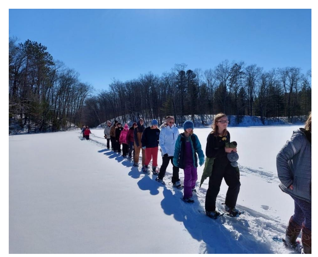
Girl Scout Snowshoe Hike at Camp Nawakwa - Saturday, Feb. 25

We are looking for volunteers to help lead a hike with Girl Scouts at Camp Nawakwa on Saturday, Feb. 25th. We will lead a hike starting at the Chalet at Camp Nawakwa at 1:00. The hike will travel across the hilltop before traveling around Picnic Lake. This will take us past Heyde House and the Horse Trail before joining up with the Ice Age Trail on the west side of the lake. Our hike will take us over the bridge at the south end of the lake. When we get to the steep hill on the east side of the lake, we will walk on the lake along the eastern shoreline ending at the beach. From there we will hike up to the flats and then back up to the Chalet.